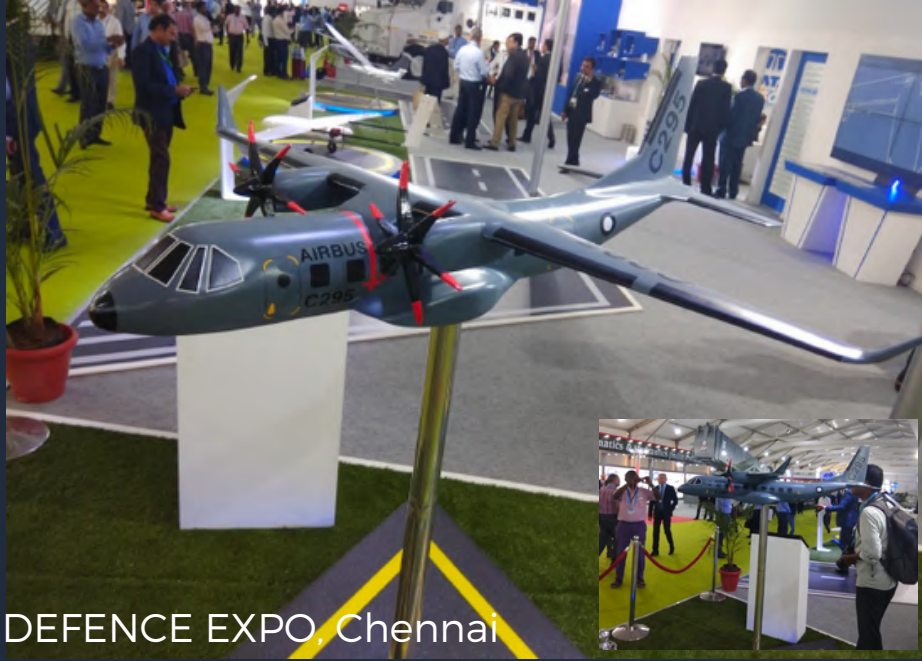
DEFENCE EXPO, Chennai

FOR TATA ADVANCED SYSTEMS LIMITED, Hyderabad