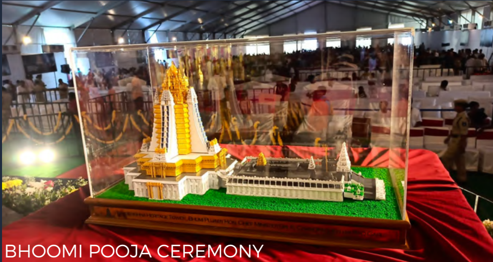
BHOOMI POOJA CEREMONY